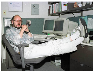
Figure: Bjarne Stroustrup, creator of C++.