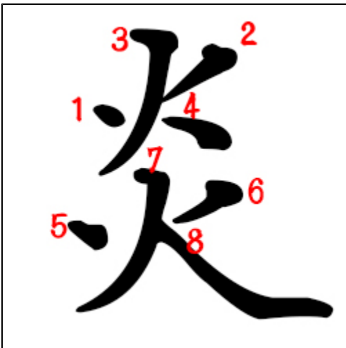
Common word: yán 'inflammation'